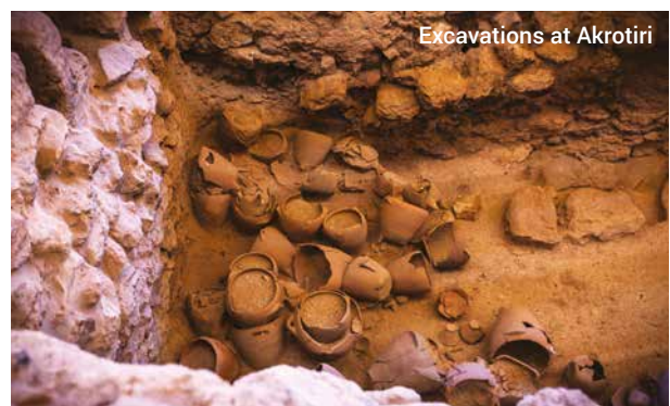
Excavations at Akrotiri

Tour may not be available at certain times of the year.