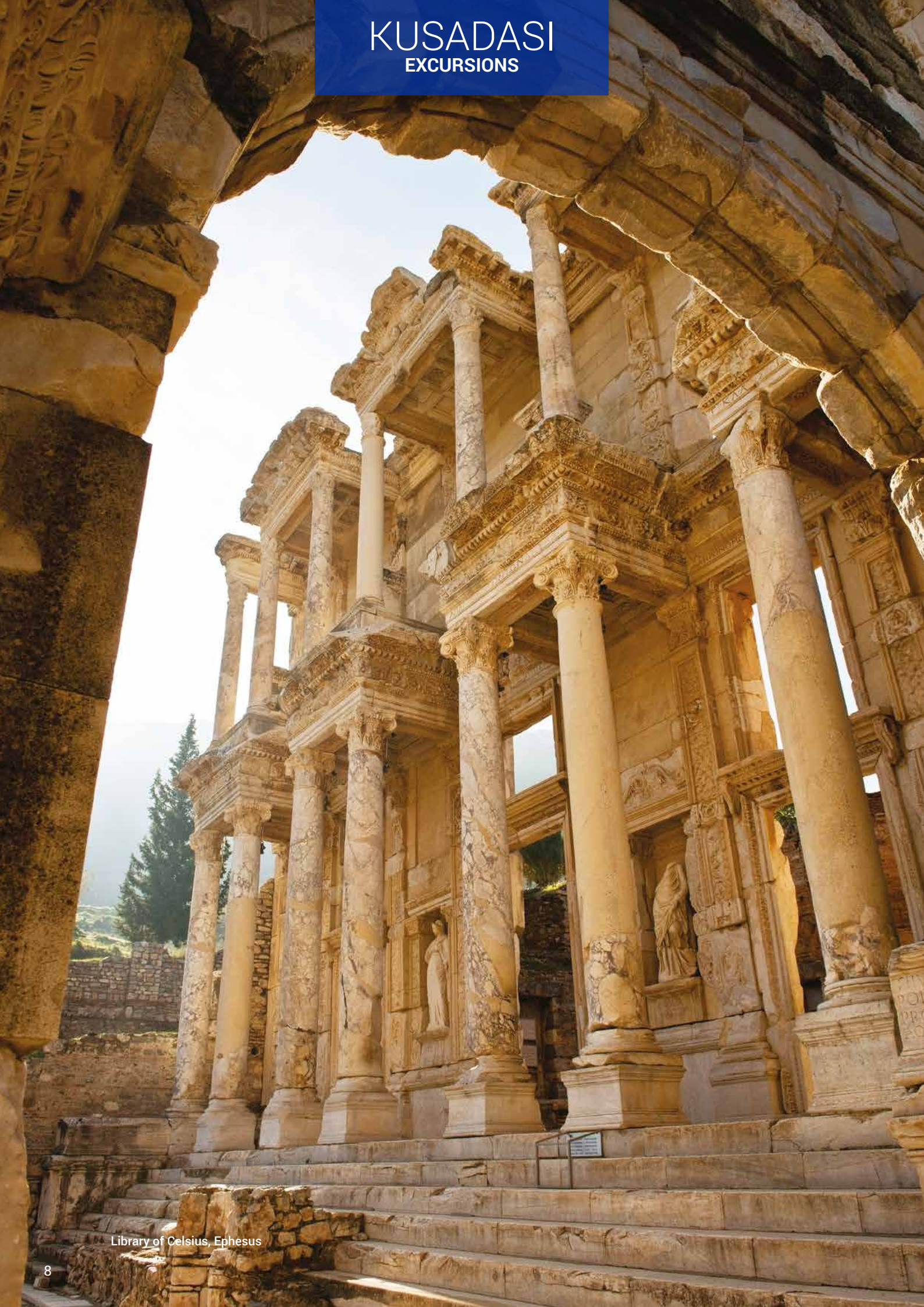
Library of Celsus, Ephesus