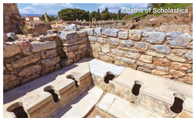
Baths of Scholastica