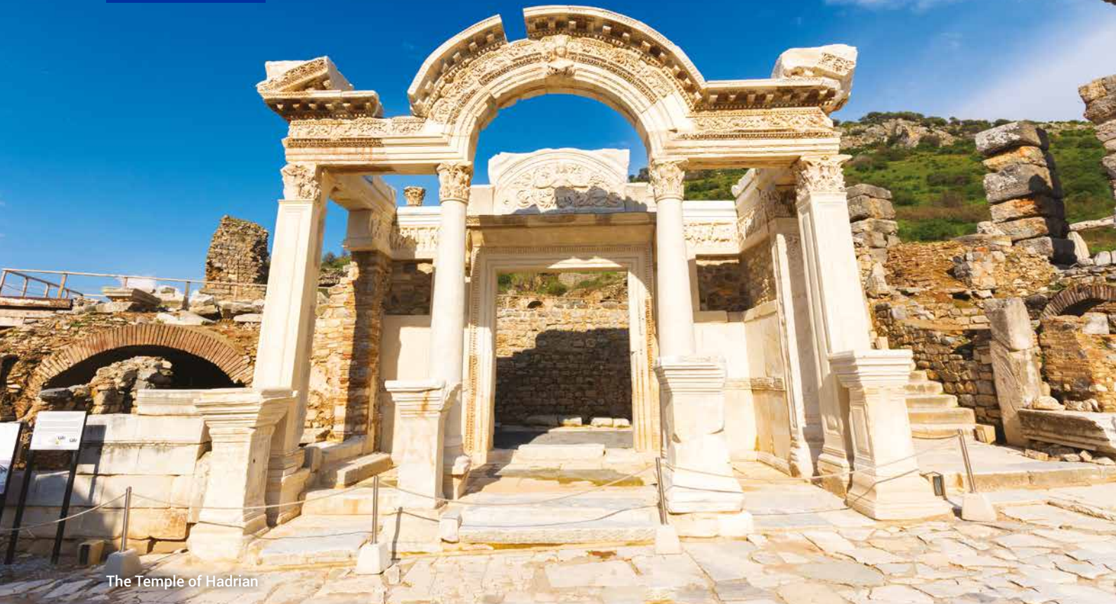
The Temple of Hadrian