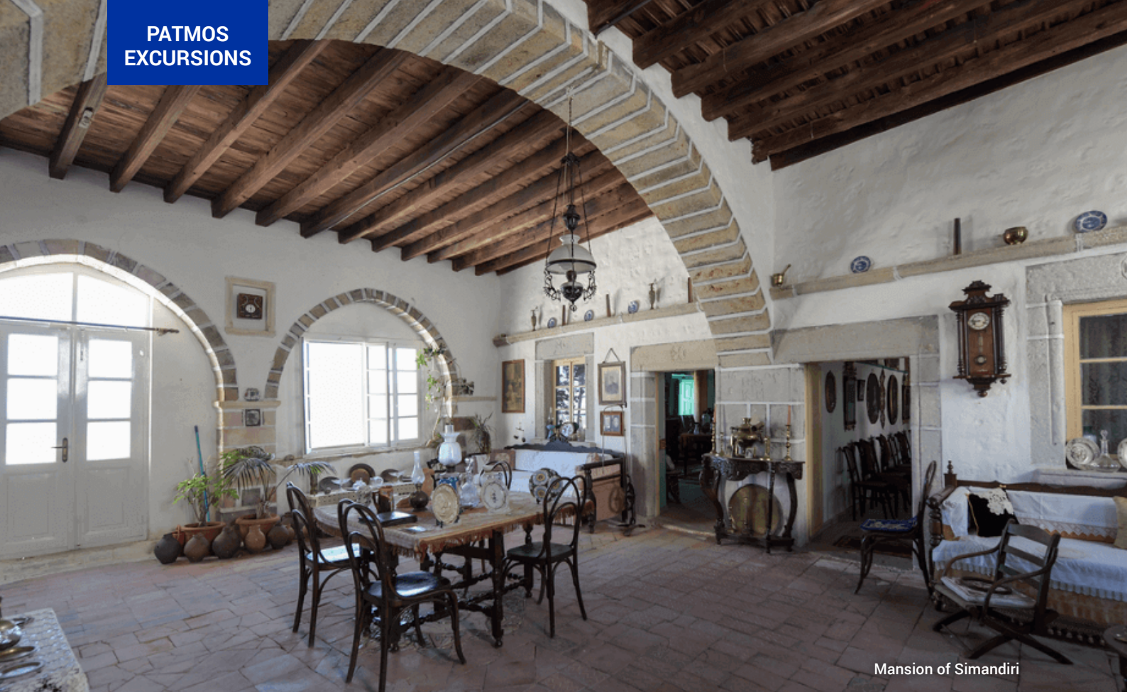
Mansion of Simandiri