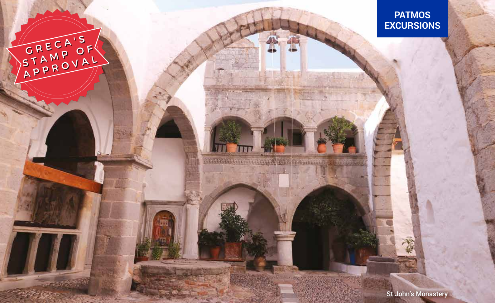
St John's Monastery