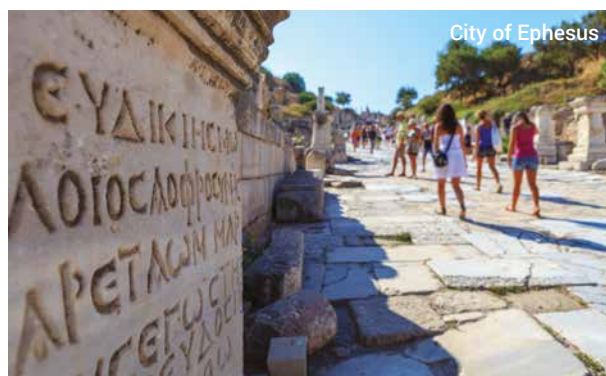
City of Ephesus

We have time for shopping for carpets, jewellery, leather and other souvenirs at the end of our tour.