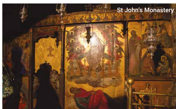
St John's Monastery

In Greek mythology Patmos originally existed at the bottom of the sea but Zeus was persuaded to allow it rise from the waters. The sun dried the land and people from the region began inhabiting the island they named Letois after the goddess Artemis.