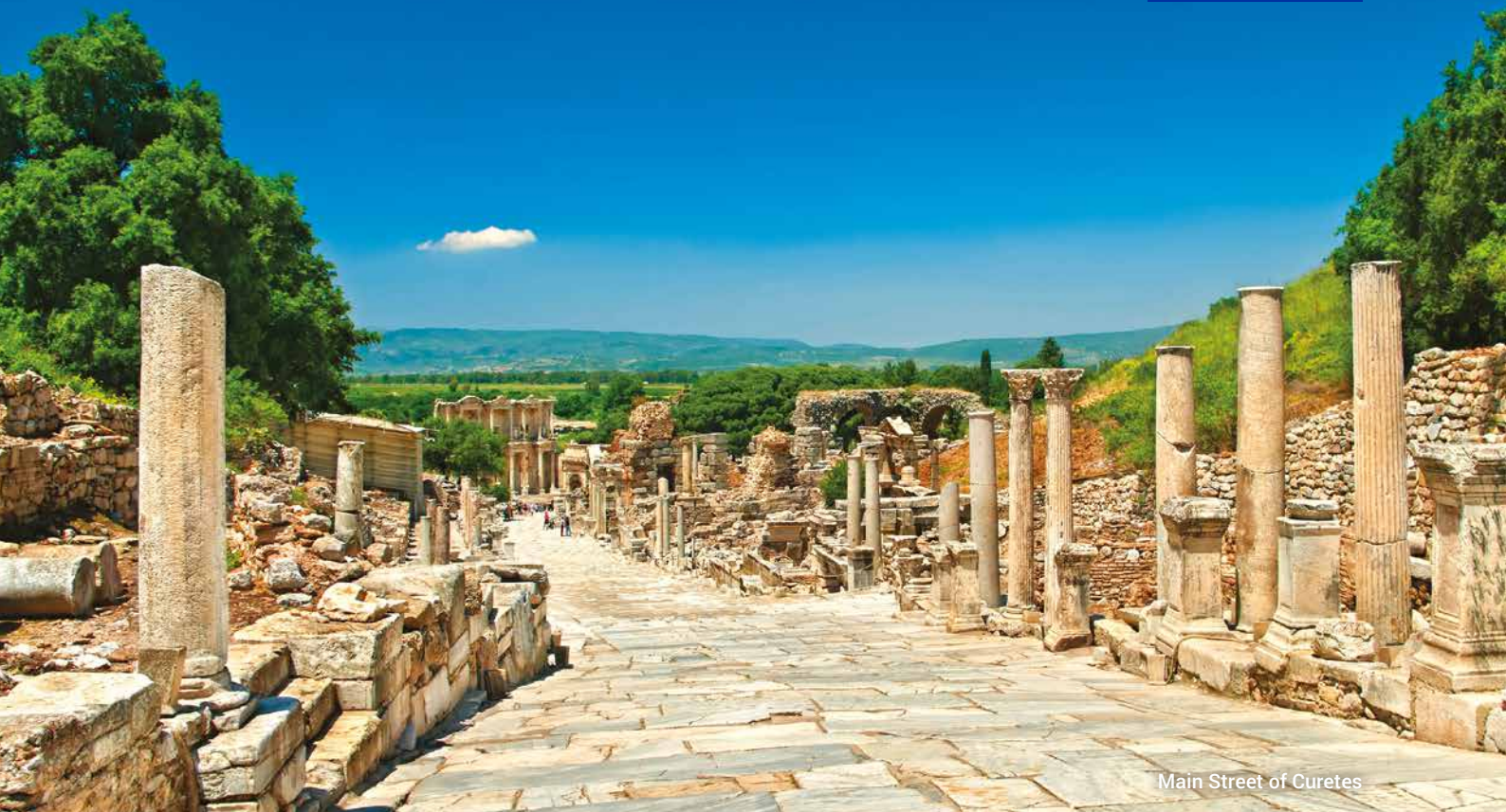
Main Street of Curetes