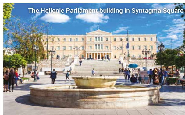
The Hellenic Parliament building in Syntagma Square

At the end of our journey we hope you will have a full appreciation of the glories of classical Athens and a sense of one of the most historically important capitals in the world.