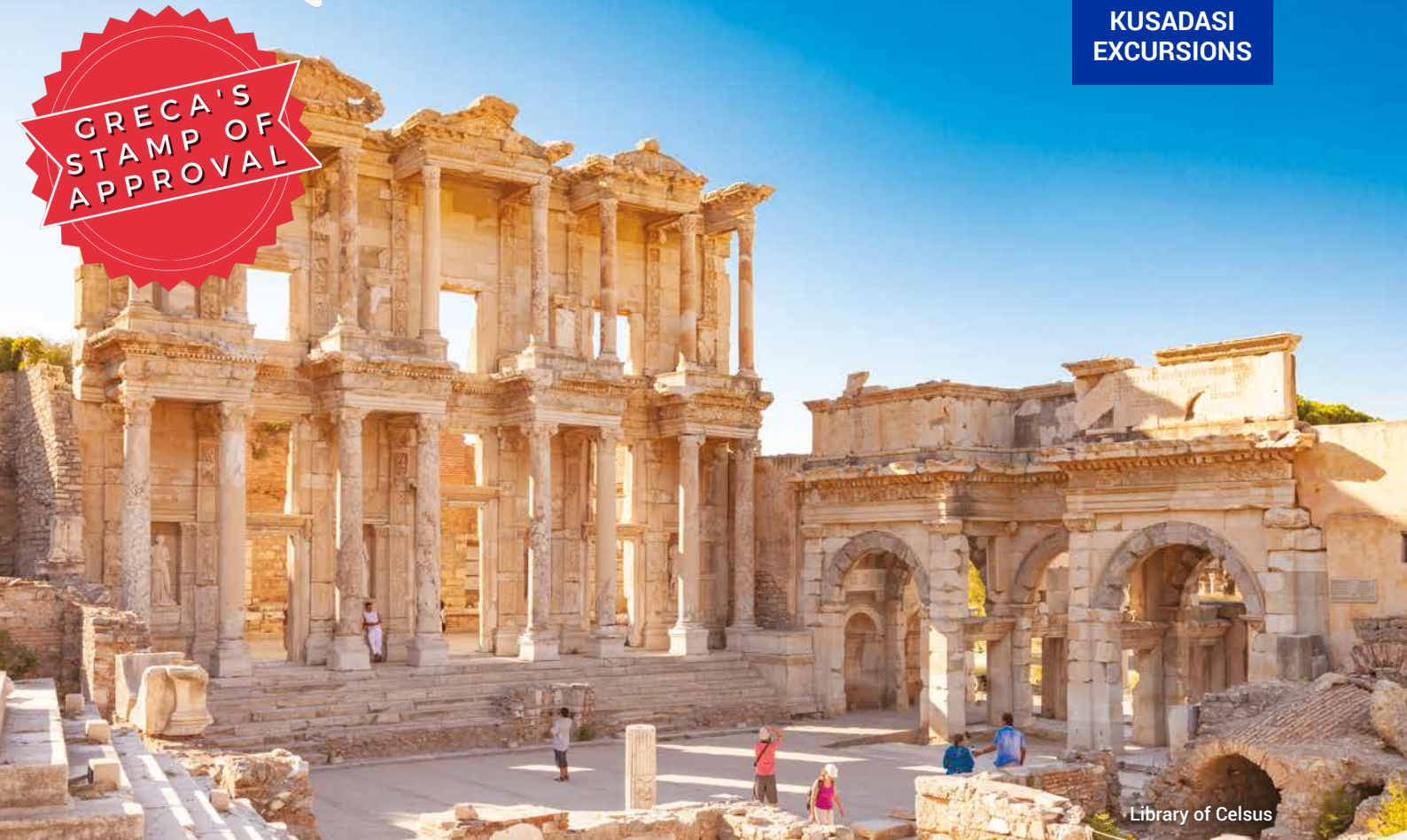
Library of Celsus