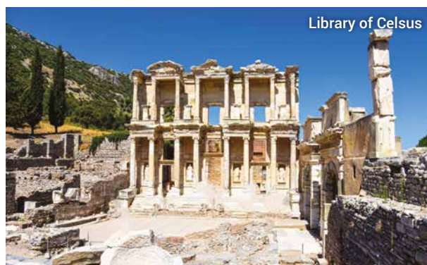
Library of Celsus