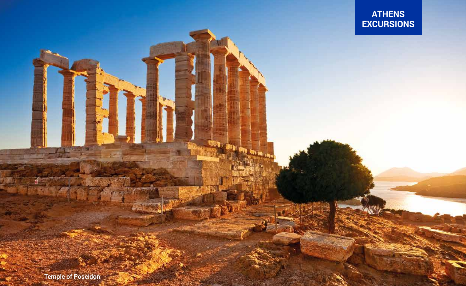
Temple of Poseidon