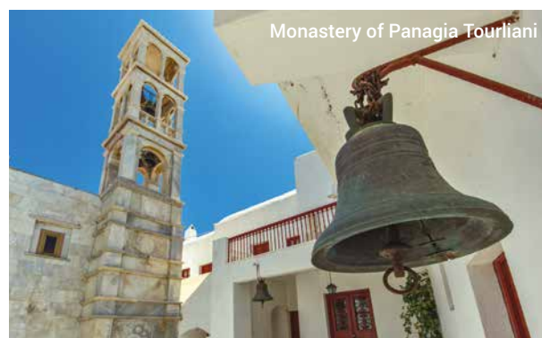
Monastery of Panagia Tourliani

Tour may not be available at certain times of the year.