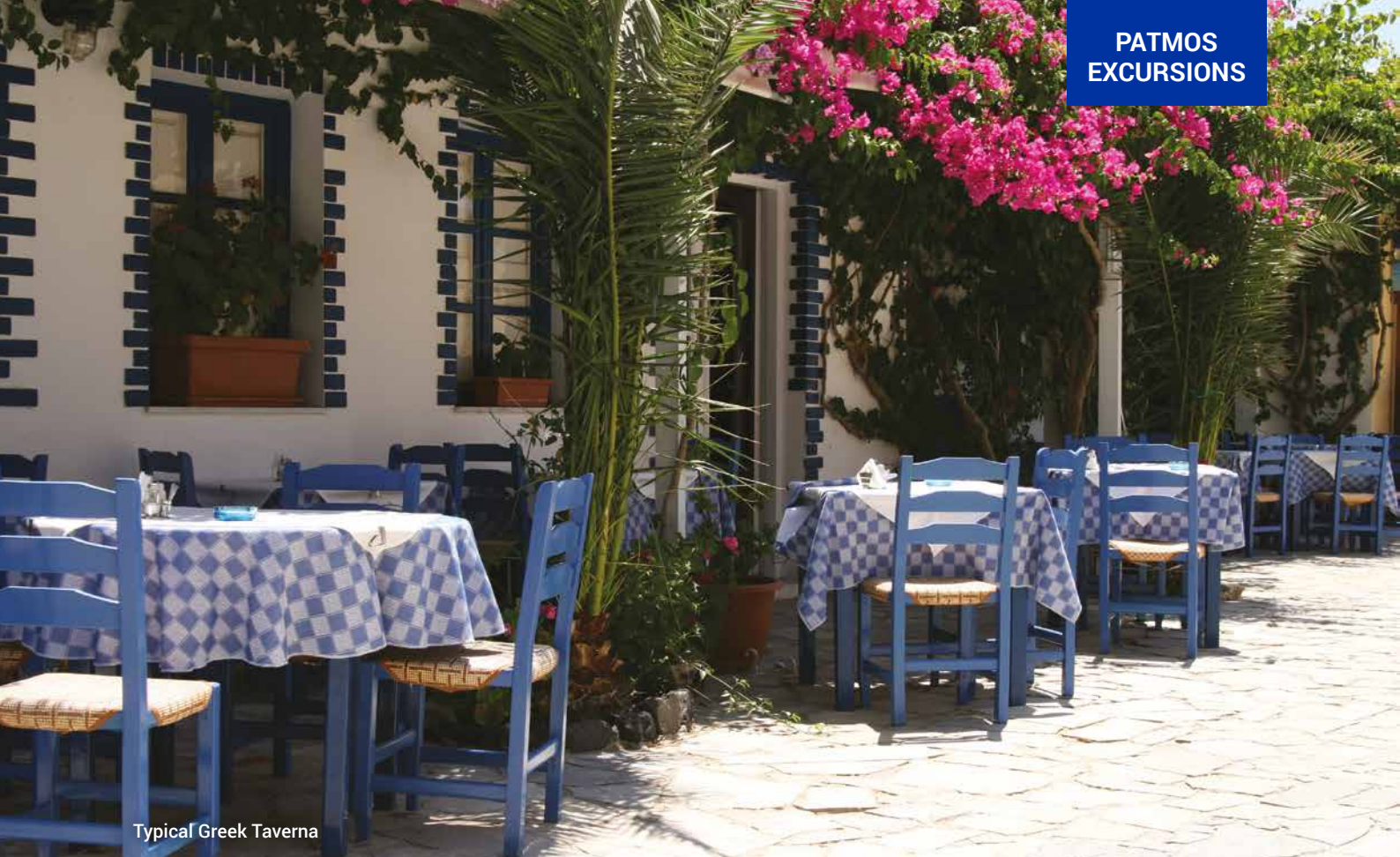
Typical Greek Taverna