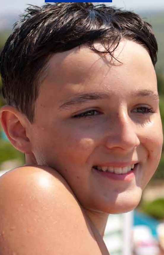
Adaland Water Park