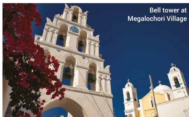
Bell tower at Megalochori Village