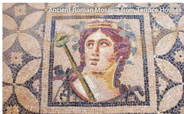
Ancient Roman Mosaics from Terrace Houses

We have time for shopping for carpets, jewellery, leather and other souvenirs at the end of our tour.