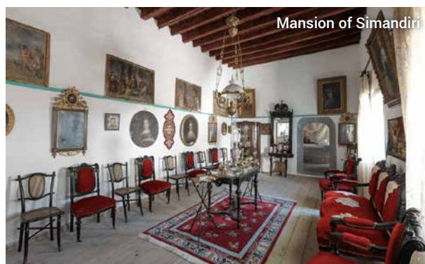
Mansion of Simandiri

Discover in the rooms antique furniture and silverware from 17th Century Russia, valuable artwork and icons from the 15th to 17th centuries. The mansion is veritable treasure trove and time machine which intrigues and fascinates.